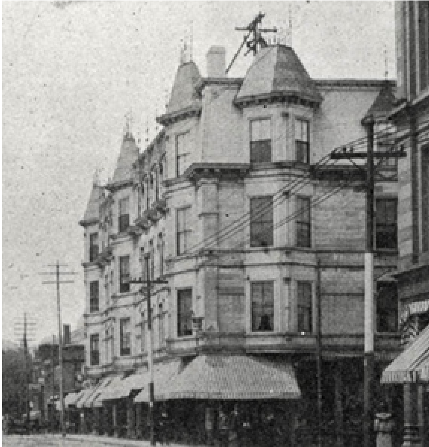
Dartmouth Hotel, historic photo