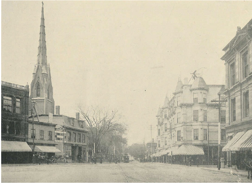
Intersection of Warren and Dudley Streets, 1895

LIVE WIRED would provide a number of smaller workshops, labs and studios, informal in nature, that would encourage exploration in the arts, through music, dance, drama, video and the visual arts. By providing access to and support for the latest in digital, video and recording technologies, LIVE WIRED will become an engaging new center for learning and education support.