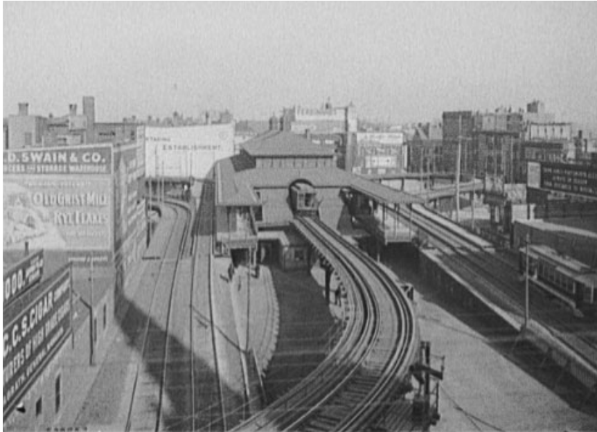
Dudley Station, northbound platform, historic photo

The goal of LIVE WIRED is to support the youth of the Roxbury community, and to create a social center enriched by multi-generational interaction, providing valuable role models for teens, adolescents and kids at risk. LIVE WIRED might provide programs and classes for young professionals as well as seniors, serving as a center for adult education and lifelong learning.