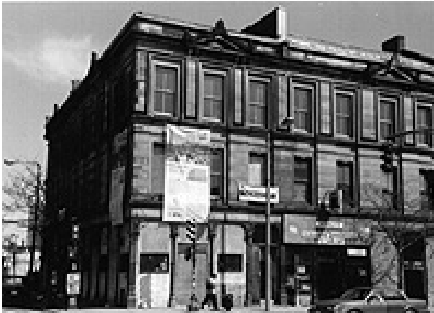
Palladio Building, historic photo